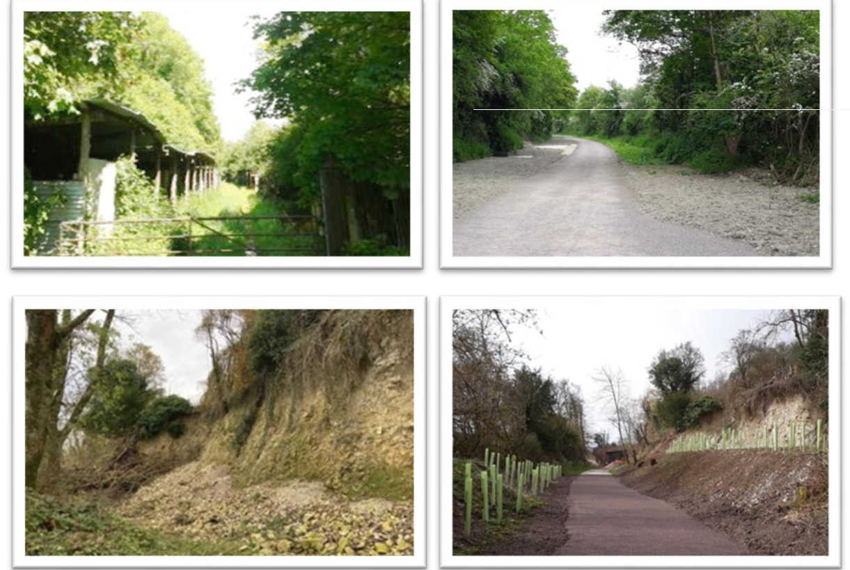
Figure 2. Before & After Photos

which, after 130 years, was showing its age. These are behind us now, and over the coming months, we will be installing signage and completing the fencing. During the winter season we will be restocking this section; we have already sown wildflowers along the route boundary and will be planting hedging and hundreds of native trees before December. These will replace the diseased and dangerous trees that were removed due to the prevalence of ash dieback. This extensive replanting will increase the habitat's resilience and biodiversity along the route. As an added enhancement, we have found space for a small heritage orchard to offer a free snack to a lucky few. We plan to open this first short section in the Spring of 2024.